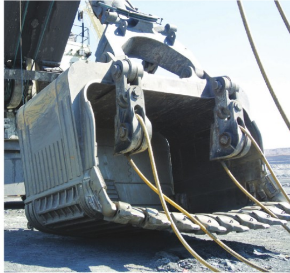
SOPHISTICATED SENTINEL The mine employs big drills that allow explosives to be placed at greater depths and 'gigantic' trucks that carry heavier loads

The mine is currently producing around 150 000 t/y of copper and is